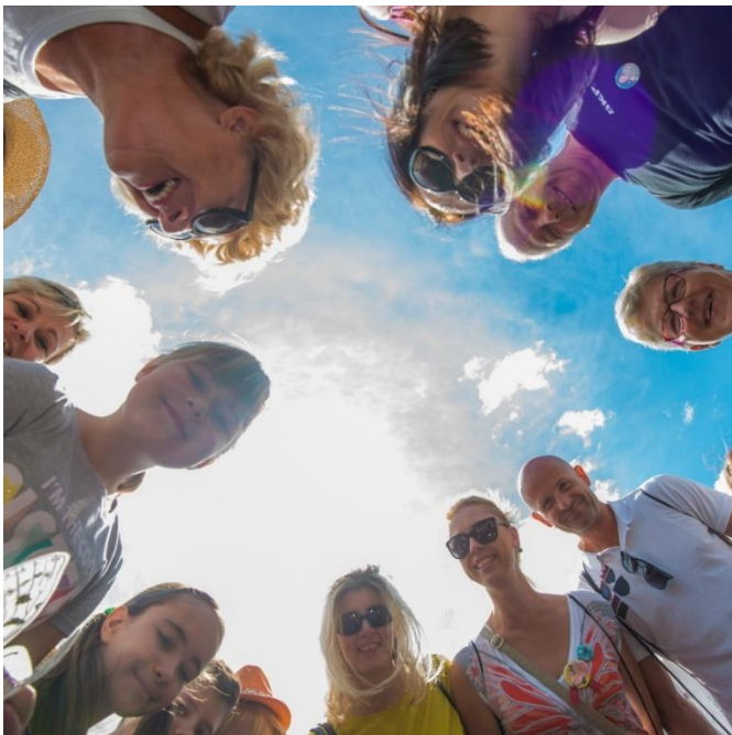
Engagement of local community

If the tourism in your place or region depends on protected areas, monuments, historic sites, museums, zoos, botanical gardens or other heritage places you might want to adopt the heritage interpretation approach to the recreation of tourism.