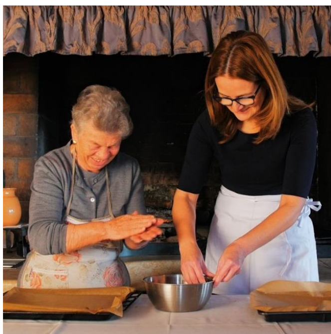
Culinary heritage

Together with an Interpret Europe team of trainers, they have educated local stakeholders and facilitators as well as restaurateurs, tasting facilities and culinary workshops, with the aim of creating experience on many levels.