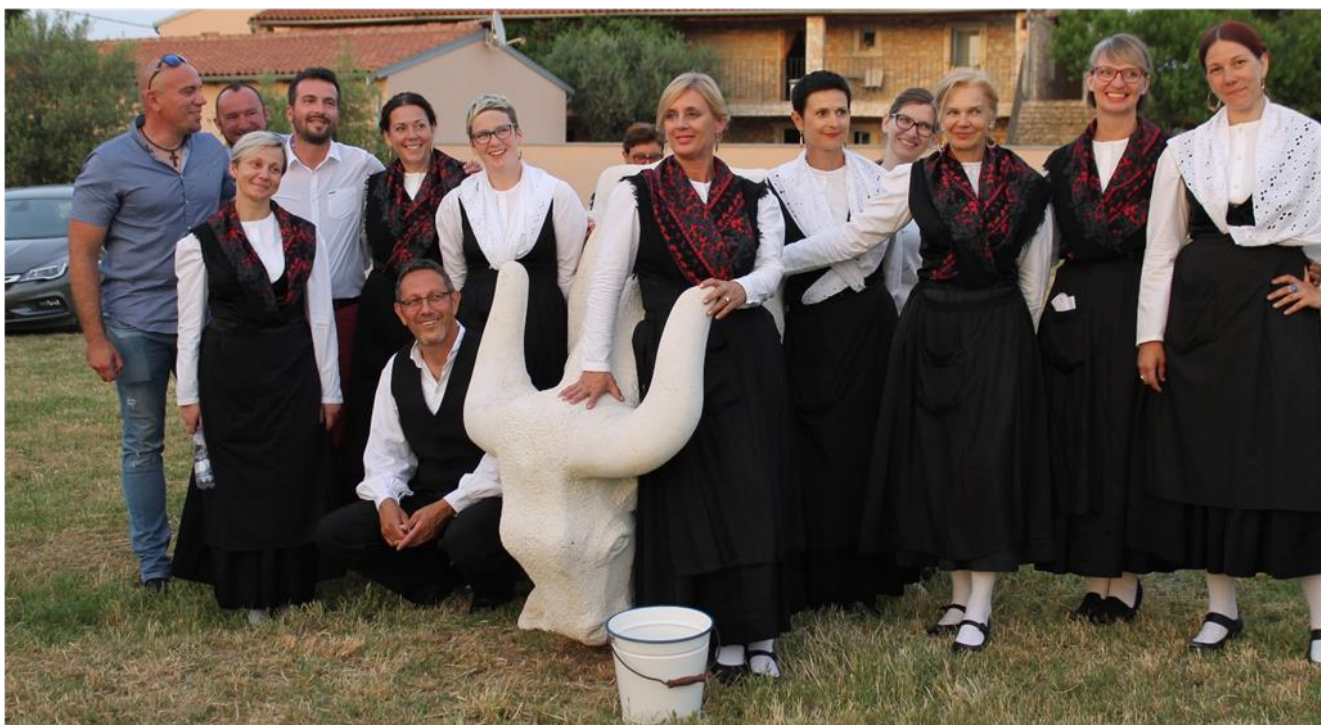
Interpretive training event

Tours of considerable quality were designed in a short time with little money. The Tourist Board offers them free of charge, so that guests can enjoy all the authentic aspects of the region.