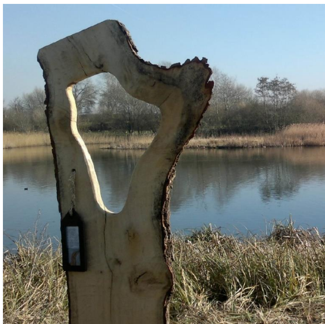
Window of opportunity