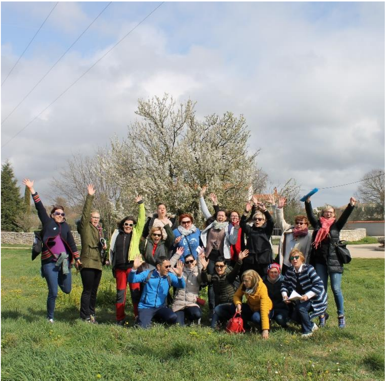
Interpretive training event

Join our initiative email us at tourism@interpret-europe.net