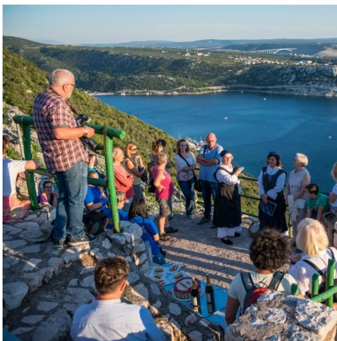
Personal interpretation

Find out more about our training programme and Join IE to make your place a hub of interpretive heritage experiences.