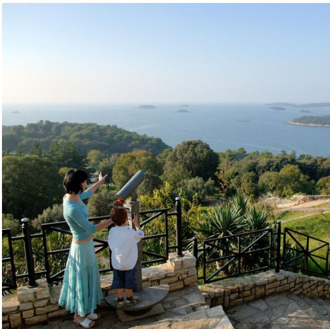
Vrsar viewpoint

Vrsar , in Croatia, is a beautiful coastal town on the Adriatic coast with attractive beaches, nautical tourism and fun family parks – a 'sea & sun' destination.