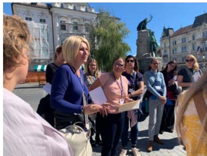
UNESCO WH interpretation planning course in Ljubljana