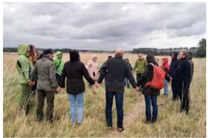
Top: Personal experience of how reeds withstand the Baltic Sea weather

Interpret Europe Newsletter – Summer-Autumn 2022