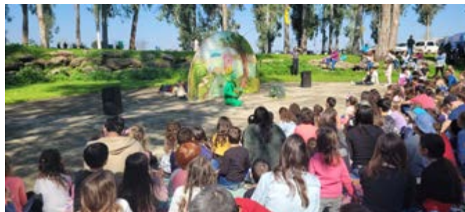
Leap frog and Frog Prince stories

won't be able to see them because Israeli law deems them "protected natural values", and we won't harm them, even for the sake of education. We designed all the activities described above – interpretive elements, models, stories and many other means of teaching and inspiring – but without the animal itself – based on this prime directive. I believe that the very absence of the 'star of the show' conveys the message that we seek to convey.