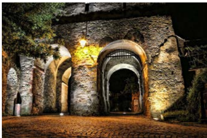
Turnul Croitorilor - The Tailor's Tower gateway to the ancient citadel

The uniqueness of the place is given by how Central Europe's culture is integrated into Eastern Europe's culture. The city's history began in 1367 when the village was declared a city. At that time, the town was defended by a powerful fortress with 14 towers and four bastions. A simple walk through the city gives you the feeling that a time journey is possible. Narrow streets paved with stone, winding among the imposing, colorful buildings with medieval air from the time when the fortress was filled with the bustle specific to guild shops and workshops.