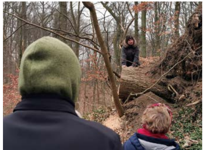
Below: What happened to this tree?