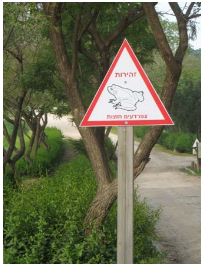
Amphibian warning road sign

As part of its nature conservation work, every year the INPA sponsors activities to better acquaint Israelis with nature conservation and to encourage them to participate in these efforts. Some events also further other goals associated with international conventions whose implementation also falls under the INPA's remit. For example, Bat Day in Israel was originally started to also urge the Israeli government to sign EUROBATS, the Agreement on the Conservation of Populations of European Bats ( www.eurobats.org ) – there are 28 bat species in Europe and 33 in Israel and all of them endangered; although Israel is not part of the European continent, the conservation of bats in Israel is important for the conservation of bats in Europe. World Migratory Bird Day ( www.worldmigratorybirdday.org ), held in May, also forms part of the educational obligations outlined by the international convention on this issue. Thousands of people of all ages come to these events.