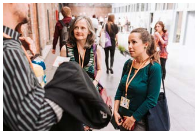
IE's Managing Director attended the European Commission EHL award ceremony

You can contact the News Team at: news@interpret-europe.net .