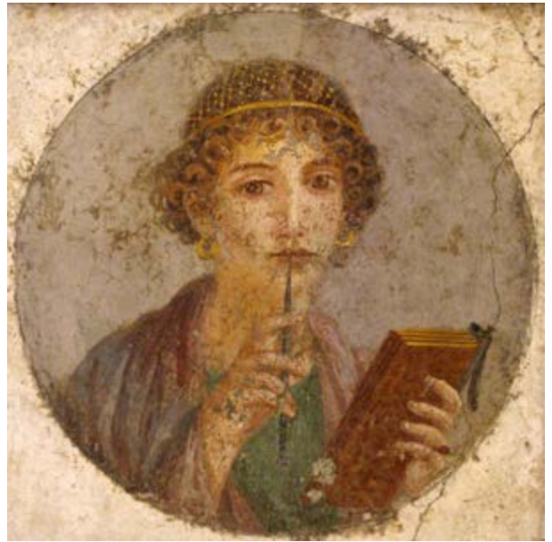
Portrait from Pompeii