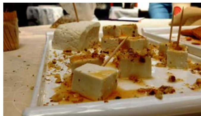
Top: What training isn't made better with wine?