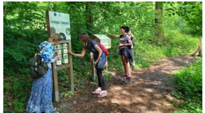
Getting inspired by an existing trail

pleasantly surprised to get so much insight from this part.