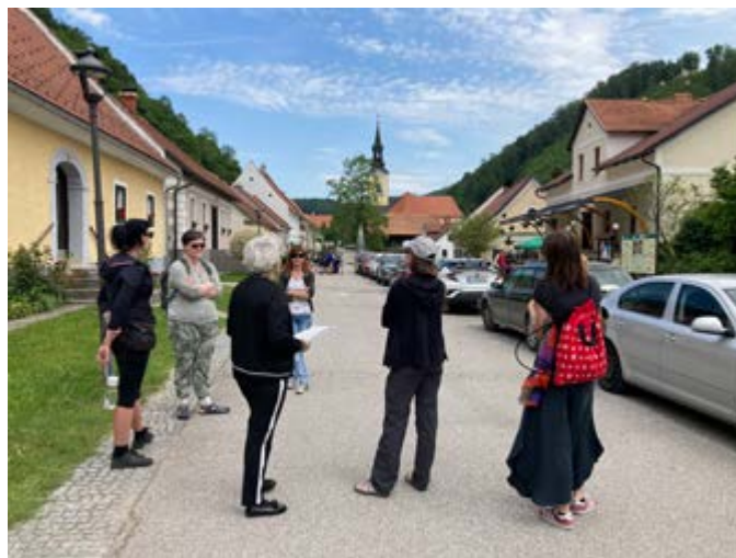
Exploring Podsreda