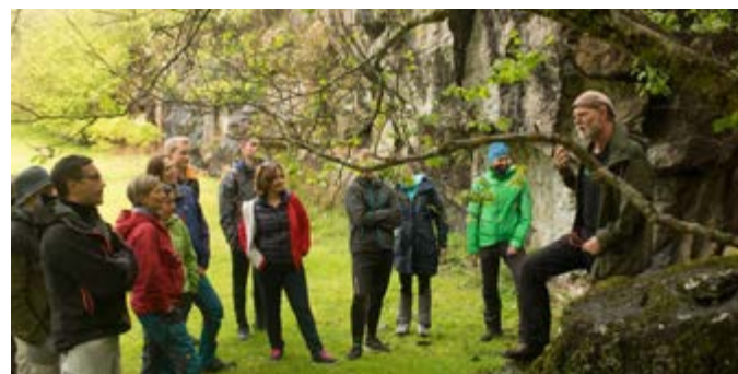
Interpretive talk