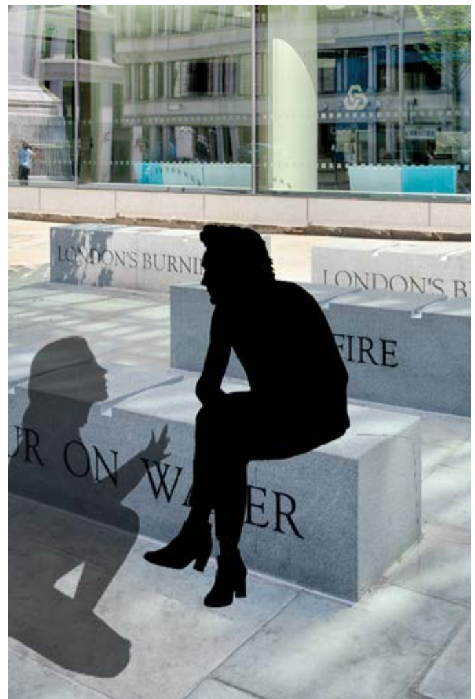
The Monument Project