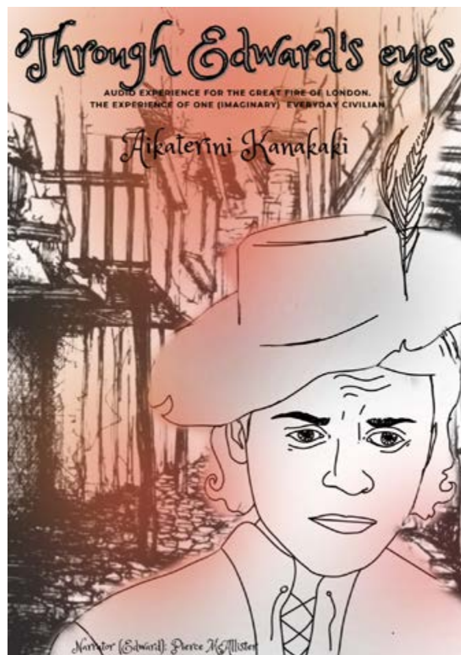
The Monument Project

Furthermore, the diverse expertise provided by the team has inspired the students with useful, hands-on advice on public engagement strategies, curatorial methods and interpretation tools.