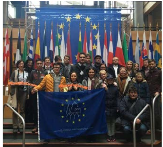
European Heritage Makers Week 2018