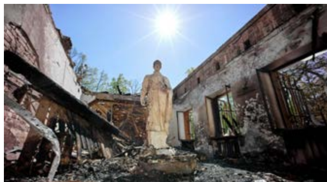
The National Literary-Memorial Museum of H.S. Skovoroda after the Russian bombardment