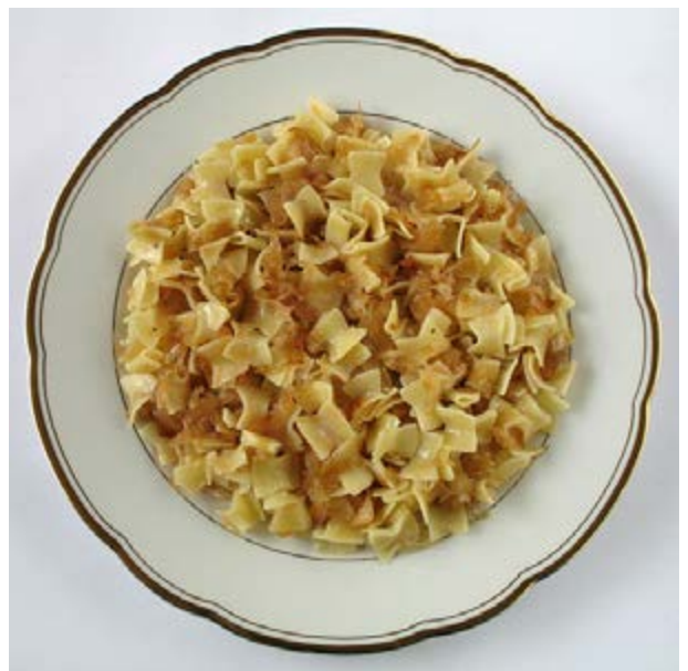
Krautfleckerl

Finally, she succumbs to old age and sickness, and takes to her deathbed. Her family assembles around her bed, inconsolable, already in mourning. Her favourite niece takes a heart and approaches her cautiously and dares to ask the question in everybody's mind: the recipe! Isn't it time to preserve that invaluable culinary legacy? To pass it on to the next generation? And so she finally asks the question: What is the secret of her famous Fleckerl?