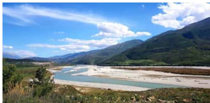
The beautiful Vjosa River

Someone called it a victory for environmentalists, but I would call it a victory for the natural heritage of Albania. Now my children can see how a river flows freely, every European can see how a river flows freely, and you can come and feel how a heart beats in a free river. Eco-tourism in Vjosa and its tributaries is ever increasing, especially in recent years in which enthusiasts have begun to enjoy activities such as rafting, canoeing, kayaking and swimming.